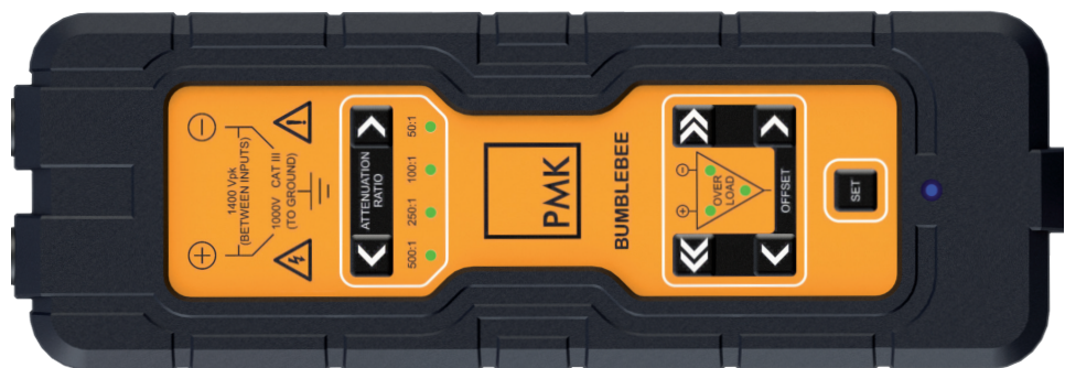
Keyboard Layout - BumbleBee®

Note: All BumbleBee® Models need a Power Supply to function. PMK recommends either a PS-02 or PS-03 Power Supply to ensure highest performance of BumbleBee® as well as other PMK active probes. There is no Power Supply included in the standard scope of delivery. See 889-09V-PS2 and 889-09V-PS3 for more information on PMK Power Supplies available at http://www.pmk.de/en/products/ps02